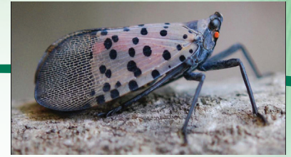
Adult, wings closed (Actual size = 1 inch)

APPLY INSECTICIDE —Only use insecticides that are registered by the Environmental Protection Agency (EPA) to treat any insect on your property. All EPA-registered insecticides have an EPA registration number and a label for safe, appropriate, and legal use. Home remedies should not be used against SLF because they may be unsafe to humans, pets, plants and may be illegal.