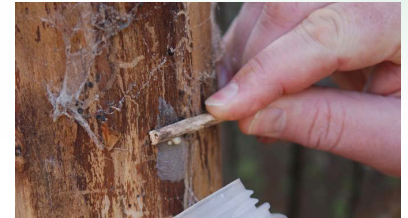
Scraping SLF egg masses from a tree.