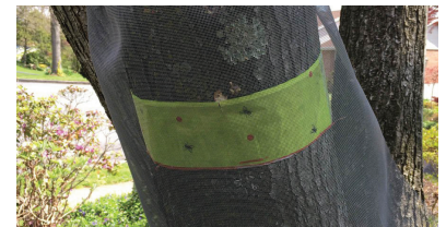
Tree Traps to Catch Nymphs